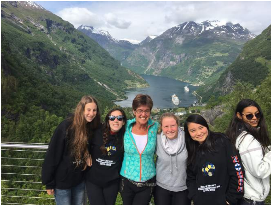
View on the Geiranger fjord

Flydalsjuvet (via 6V 63, approx. 4 km from Geiranger centre) offers an impressive view and is an excellent point for photography, with a view over Geiranger and Geirangerfjorden with the many cruise boats. Some of Norway's most popular travel photo images are taken here. The viewpoint is divided into two areas, one upper and one lower plateau, with a gangway running in between.