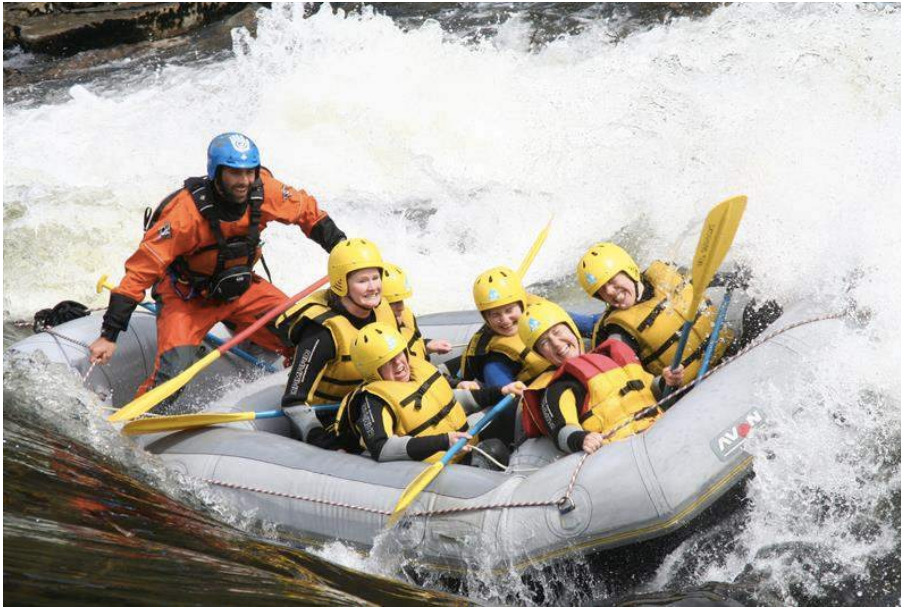
Rafting on a river close to Voss

9.45: We meet at “Voss Active” 10.00: Rafting tour – takes 3.5 to 4 hours – have towel with you, as you may want to have a shower after the trip.