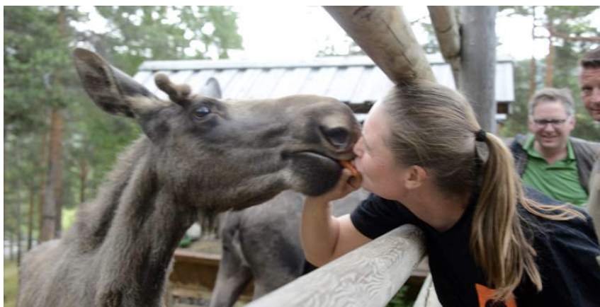
Kissing a moose in Bjørneparken