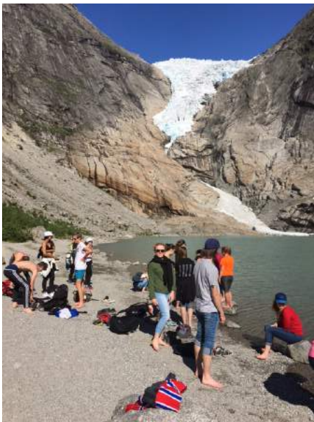
Briksdalen glacier

We leave Førde at 13.00. It takes around two hours to Olden and from there 30 minutes to Briksdalen (arrival 15.45). Put on good shoes and clothes. We will hike up to the glacier , which takes around 45 minutes. We will stay at the glacier for around 15 minutes and then make our way downwards again. The water is cold, but we had two students last year who jumped in.