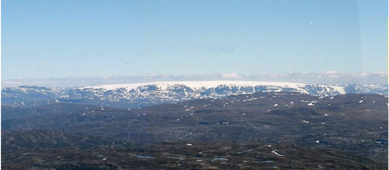
Hardangerjøkulen glacier

of Eidfjord 5 kilometres (3.1 mi) south of Finse. The 1980 movie Star Wars Episode V: The Empire Strikes Back used Hardangerjøkulen as a filming location, for scenes of the ice planet Hoth, including a memorable battle in the snow.